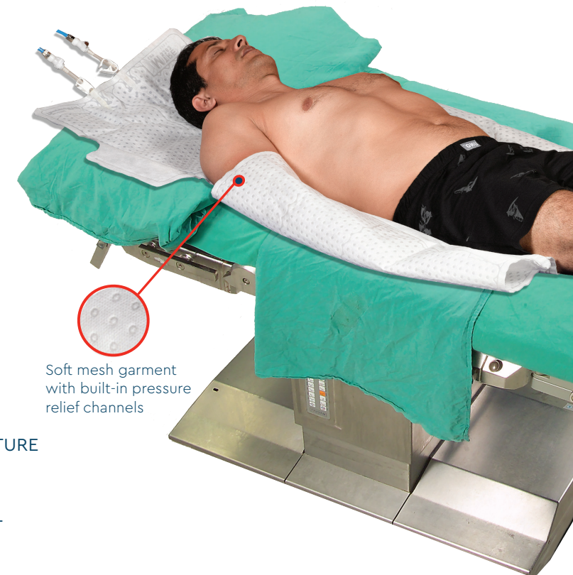
Soft mesh garment with built-in pressure relief channels